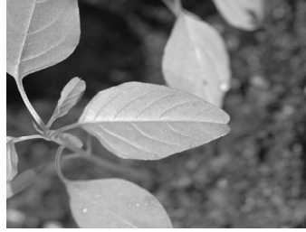
Figure 2. Notch in leaf tip of Palmer amaranth.

The stems and leaves have no to very few hairs, which causes these plant parts to feel smooth to the touch. Leaves are alternate on the stem and are generally lance-shaped or egg-shaped and frequently with prominent white veins on the underside. As plants become older, they often assume a poinsettia-like appearance and occasionally have a V-shaped chevron on the leaves (Figure 3). Leaves are attached to the stem by petioles; petioles at the base of the stem usually are as long or longer than the leaf blade.