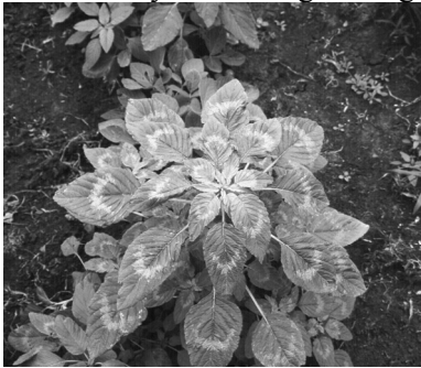
Figure 3. White chevron on the leaves of Palmer amaranth.

The stems and leaves have no to very few hairs, which causes these plant parts to feel smooth to the touch. Leaves are alternate on the stem and are generally lance-shaped or egg-shaped and frequently with prominent white veins on the underside. As plants become older, they often assume a poinsettia-like appearance and occasionally have a V-shaped chevron on the leaves (Figure 3). Leaves are attached to the stem by petioles; petioles at the base of the stem usually are as long or longer than the leaf blade.