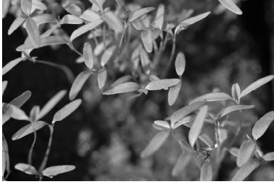
Figure 1. Cotyledons of Palmer amaranth.