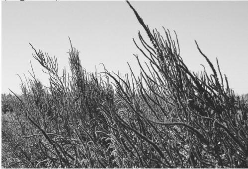
Figure 5. Mature Palmer amaranth plants.

The tepals are about twice the length of the seed, and the seed capsule (utricle) breaks into 2 regular sections when fractured. Grabbing the inflorescence of a mature female Palmer amaranth plant with a bare hand is not recommended as the bracts are very stiff and sharp. The terminal inflorescence of male Palmer amaranth plants is much softer to the touch. Palmer amaranth is an aggressively growing plant that often reaches 6 to 8 feet in height (Figure 5).